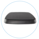
North 1 Seat PU